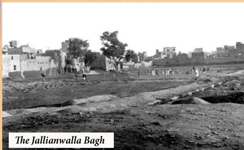
The Jallianwalla Bagh