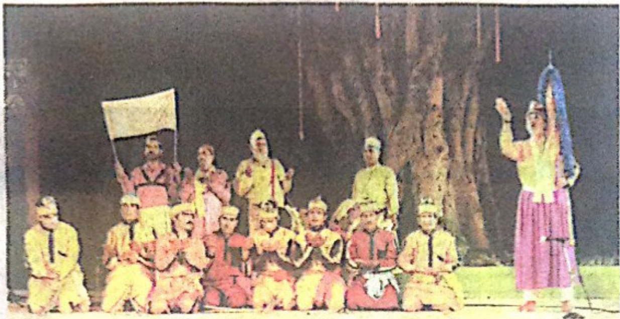
Artists from Jammu and Kashmir performing at the Sangeet Natak Akademi