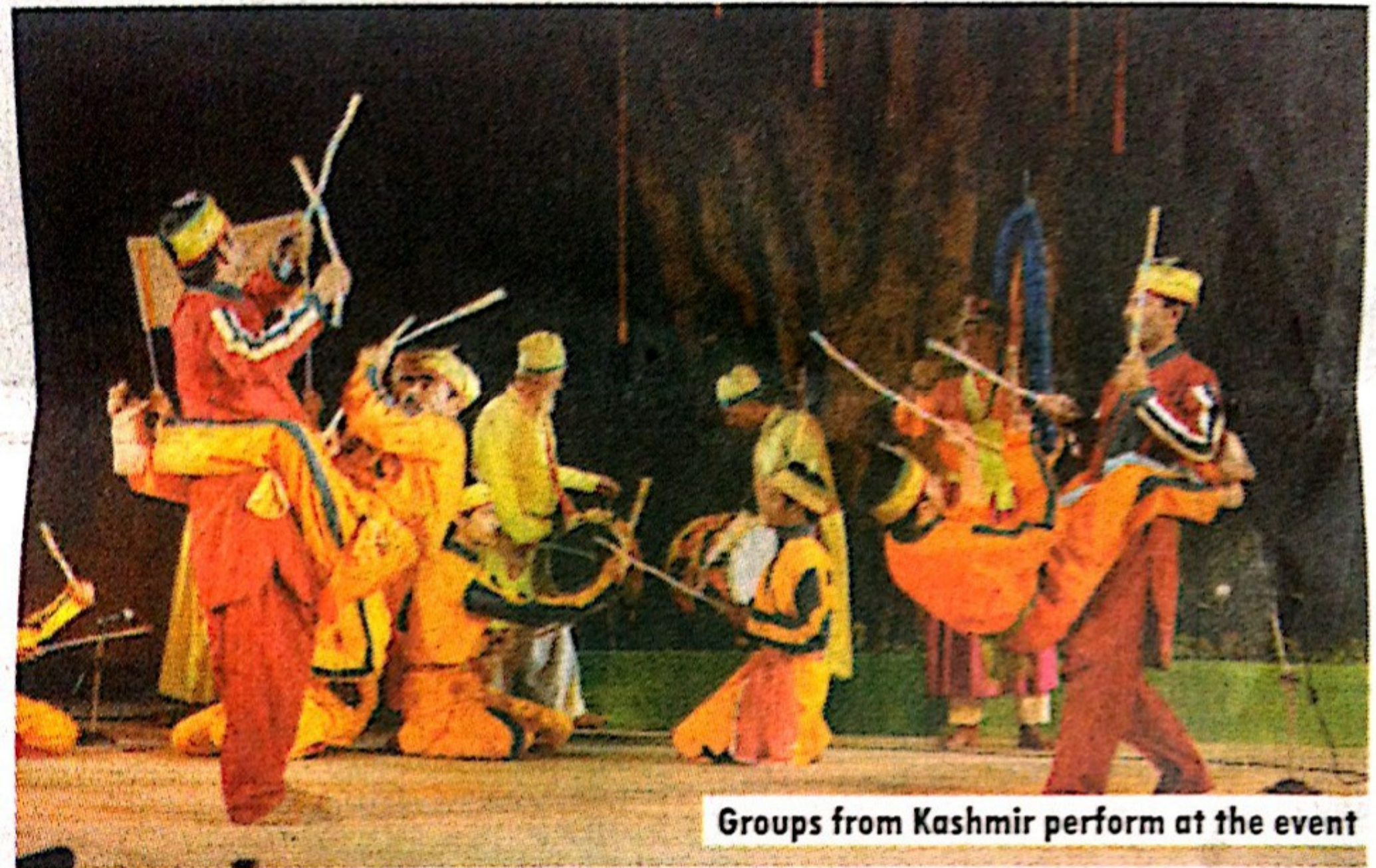
Groups from Kashmir perform at the event