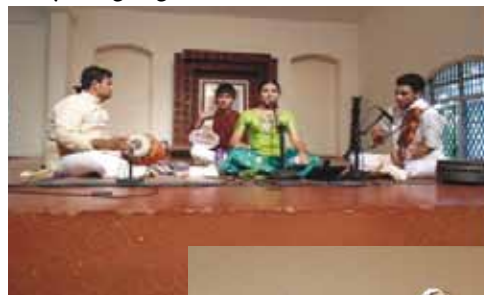
Young and budding talent presented as part of the Monthly Cultural Programs at the Tagore Hall

In July 2014, the Monthly Cultural Programs were introduced at Tagore Hall for the upcoming academic year to showcase very young talent in the field of Classical Music and Dance. These monthly programs form a component of Kalakshetra’s responsibility towards encouraging the younger generation to take on the mantle of the arts.