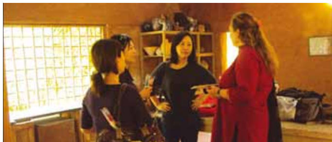
Indian and Korean Artists came together in Kalakshetra for the InKo Ceramic Residency.

A Ceramic Residency bringing together 6 Korean artists and 6 Indian Artists commenced at the Visual Arts Department of Kalakshetra on 19th January. The Residency was organized in collaboration with the Lalit Kala Akademi, Chennai and Indo-Korean Cultural Centre, Chennai. This was a 41 day camp where artists from both cultures built works inspired by each other.