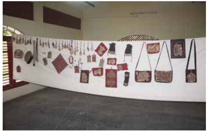
Products created by staff of CERC during the workshop by Smt Usha Prajapati

Usha Prajapati to train staff in tailoring and stitching in creation of new and trendy products using cotton hand painted and hand printed material.