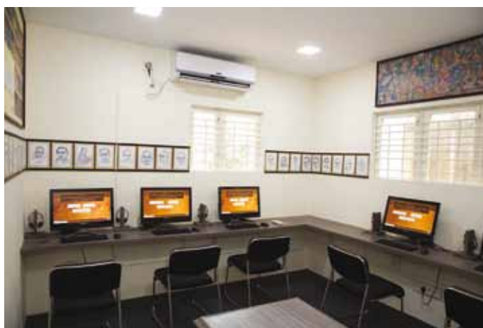
The TAG Kalakshetra Listening Archives Centre