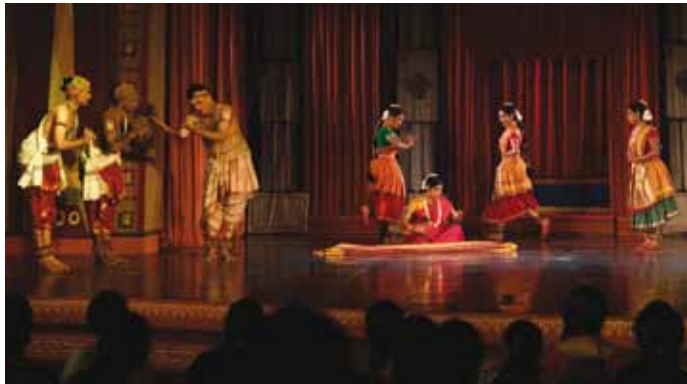
A Scene from dance drama Andal Charithram performed by the Repertory Company