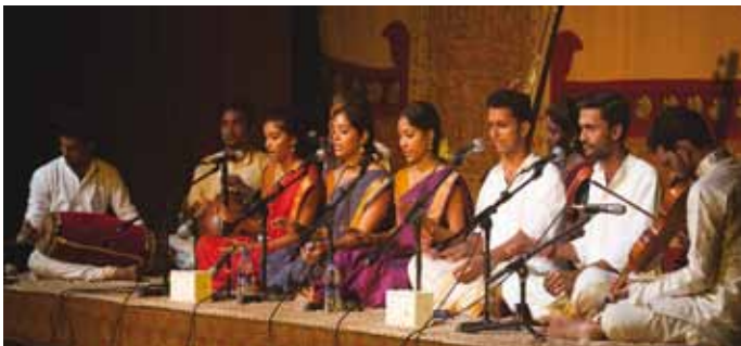
Music Students of Kalakshetra perform during the Remembering Trinity Festival