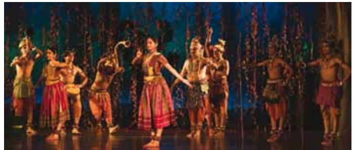
A Scene from dance drama Kannapar Kuravanji performed by the Repertory Company

The month of December was a busy period for the Kalakshetra Repertory Company which performed at various venues especially featuring as part of the December Dance and Music Season of Chennai :