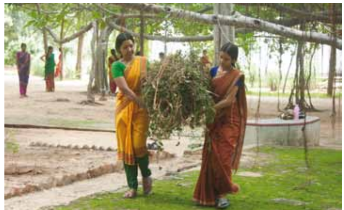
Students and Staff of Kalakshetra engaged in a Campus Cleaning Drive on 2nd October, 2014.

Kalakshetra Foundation joined hands with the rest of the nation in taking the cleanliness pledge on the 2nd of October 2014, under the Swacch Bharat Abhiyan! Kalakshetra and all its members, students, teachers and administrative staff alike, have always held cleanliness and respect for the environment close to their heart, and with this oath the Institution continued to pledge its commitment to the cause. The staff and students also engaged in a cleaning drive of the college campus.