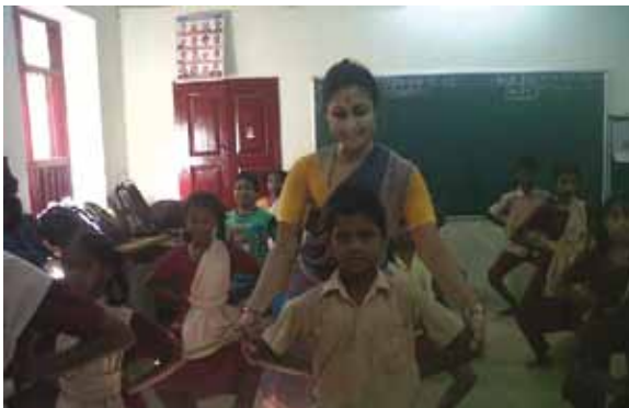
Classes in progress at a state-run school as part of Kalakshetra's Outreach Project