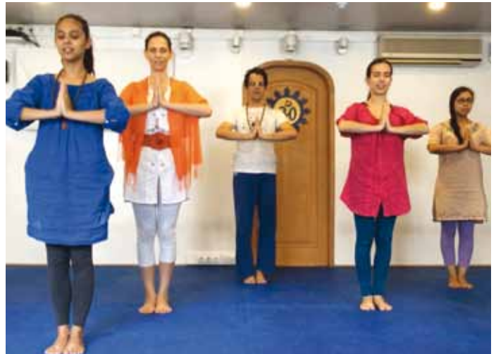
Bharatanatyam Outreach Workshop in Portugal

yoga practitioners and students at the Host organisation. The workshop was very well received and provided good insight and training in Bharatanatyam to the attendees.